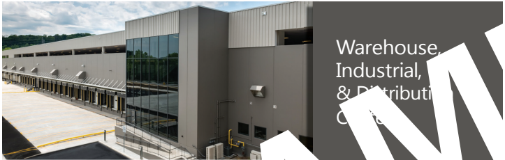
Warehouse, Industrial, & Distribution Center

At March Associates Construction, we manage world class commercial real estate development projects—and build great relationships along the way. Our clients are pleased with the results of our work, bringing us their repeat business and referrals for years to come. Take a closer look at March to see how we can help you achieve your construction goals. Please visit us at: www.marchassociates.com