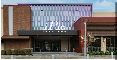
Movie Theaters & Entertainment