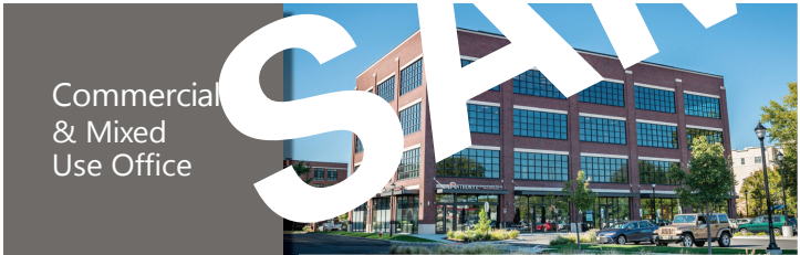
Commercial & Mixed Use Office