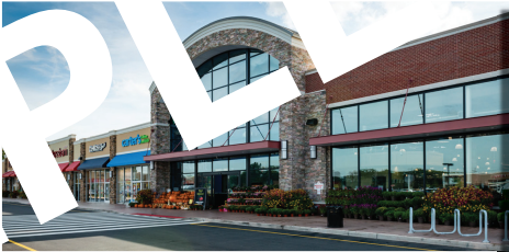
Shopping Centers, Retail & Supermarkets